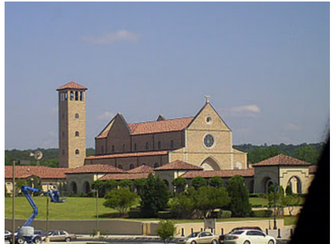
Monastery trip to EWTN.